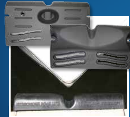
BOAT & PWC BOW GUIDES