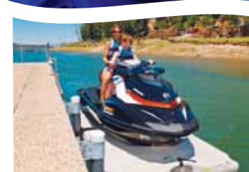
DRIVE ON TO DOCK