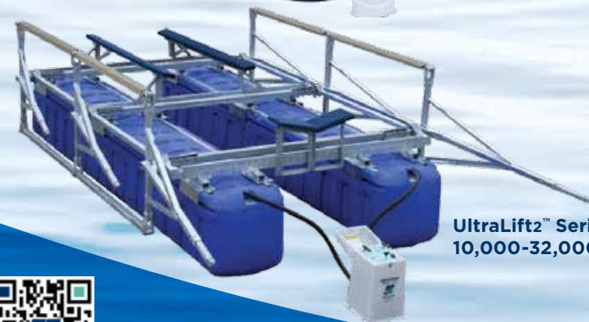
UltraLift2™ Series 10,000-32,000