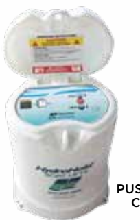
PUSH BUTTON CONTROL