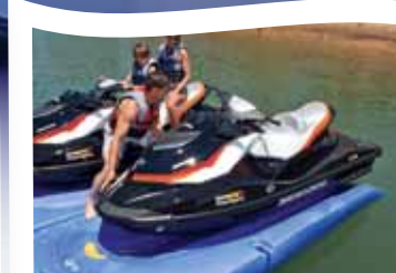
ROLL OFF TO LAUNCH