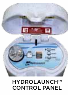
HYDROLAUNCH™ CONTROL PANEL