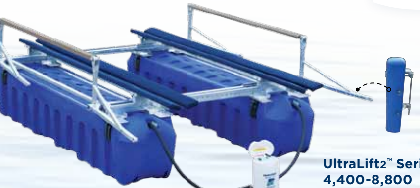
UltraLift2™ Series 4,400-8,800