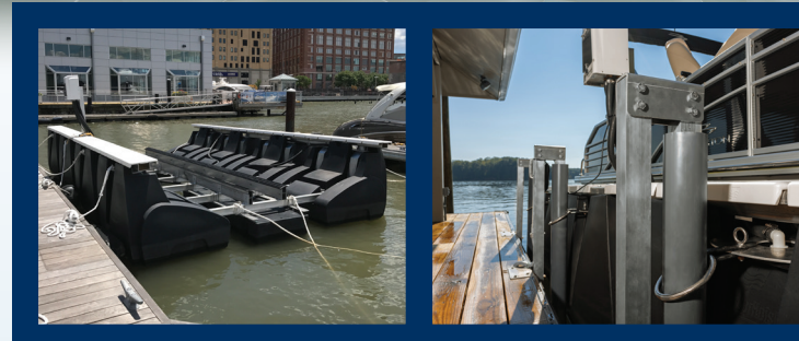
Simply tied to the dock Optional ring mooring kit