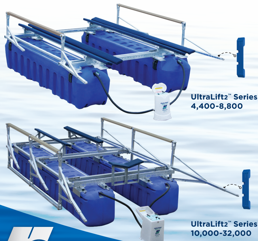
UltraLift™ Series 4,400-8,800